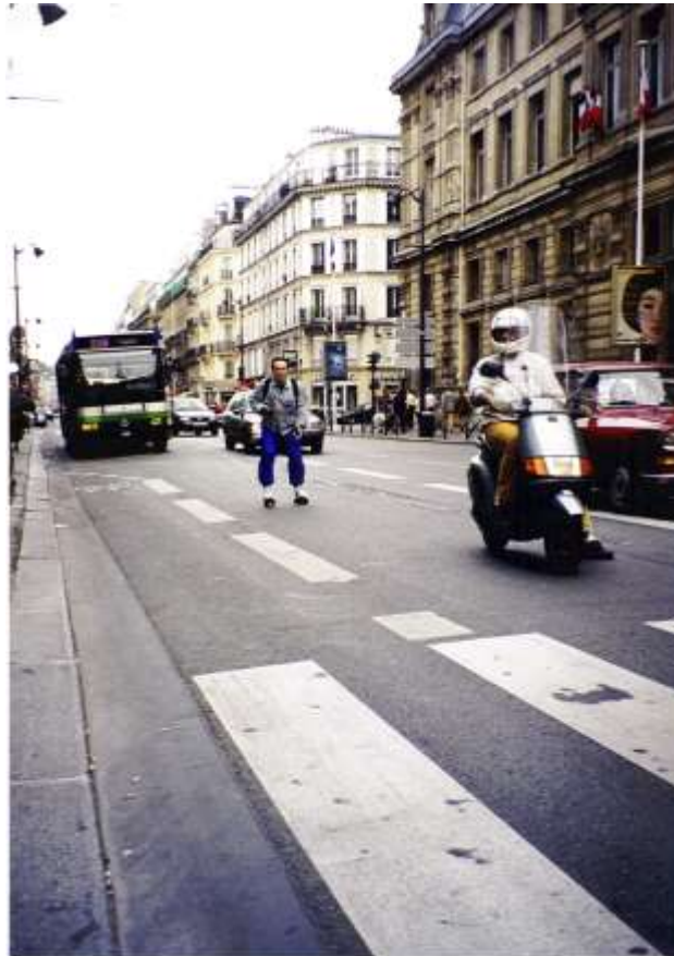
Rue de Rivoli in Paris, 1997